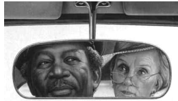
DRIVING MISS DAISY

Winner of the 1988 Pulitzer Prize and the Outer Critics Circle Award for Best Off-Broadway Play, this warm-hearted story about the relationship between an aging, white southern Jewish liberal and a proud, but soft-spoken black man, continues to win hearts of all ages. The cost covers the show,