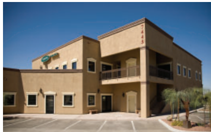
The Sun Professional Building expresses the Southwestern approach to architecture, which is reminiscent of the Santa Fe and Pueblo style of building design. Exteriors incorporate natural colors and elements that improve energy efficiency, while interiors reflect an emphasis on comfort and convenience.