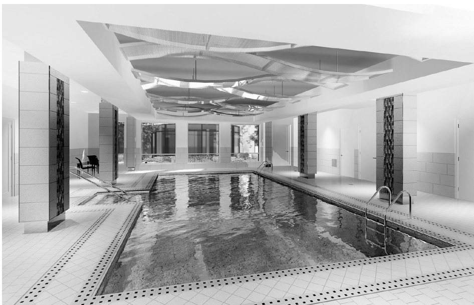
An artist rendering of the soon to be opened indoor pool is shown.