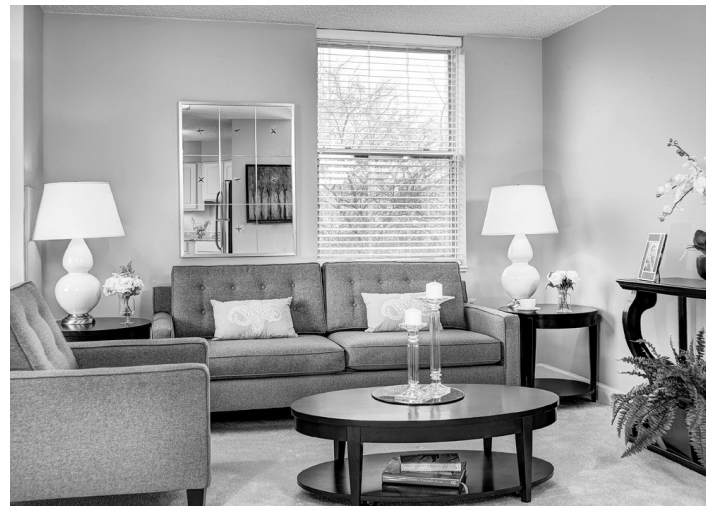
One of the living units at Mather Place of Wilmette is shown.