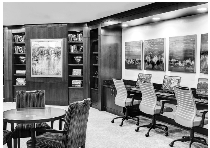
The library is one the most popular places at Mather Place of Wilmette.